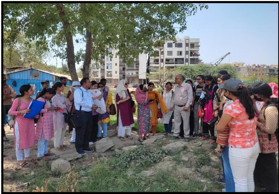
Image 2: Faculty and students engaging in field work with one of the key informants of the study area

The study highlights the importance of developing customized disaster management strategies to bolster community resilience. Key recommendations focus on improving early flood warning communication channels, increasing the accessibility of government shelters, and addressing infrastructural deficiencies. These findings support continuous efforts to enhance disaster management and resilience in flood-prone areas such as Okhla and similar communities.