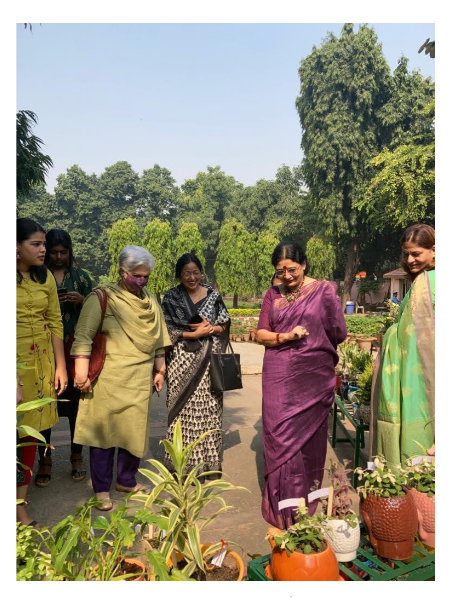
"Hariyali": Sale of potted plants on 1^{\text{st}} November, 2021