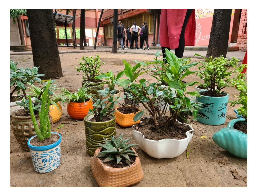
Potted plants prepared by students using organic compost made in the College.