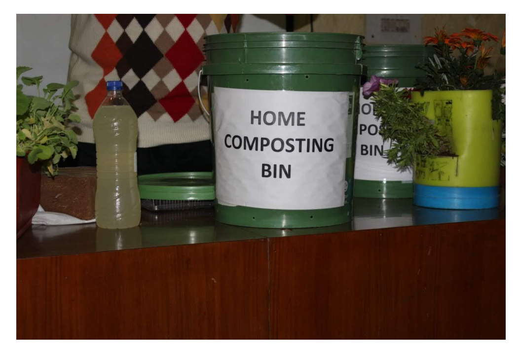
Workshop on Sustainable living for teachers and students