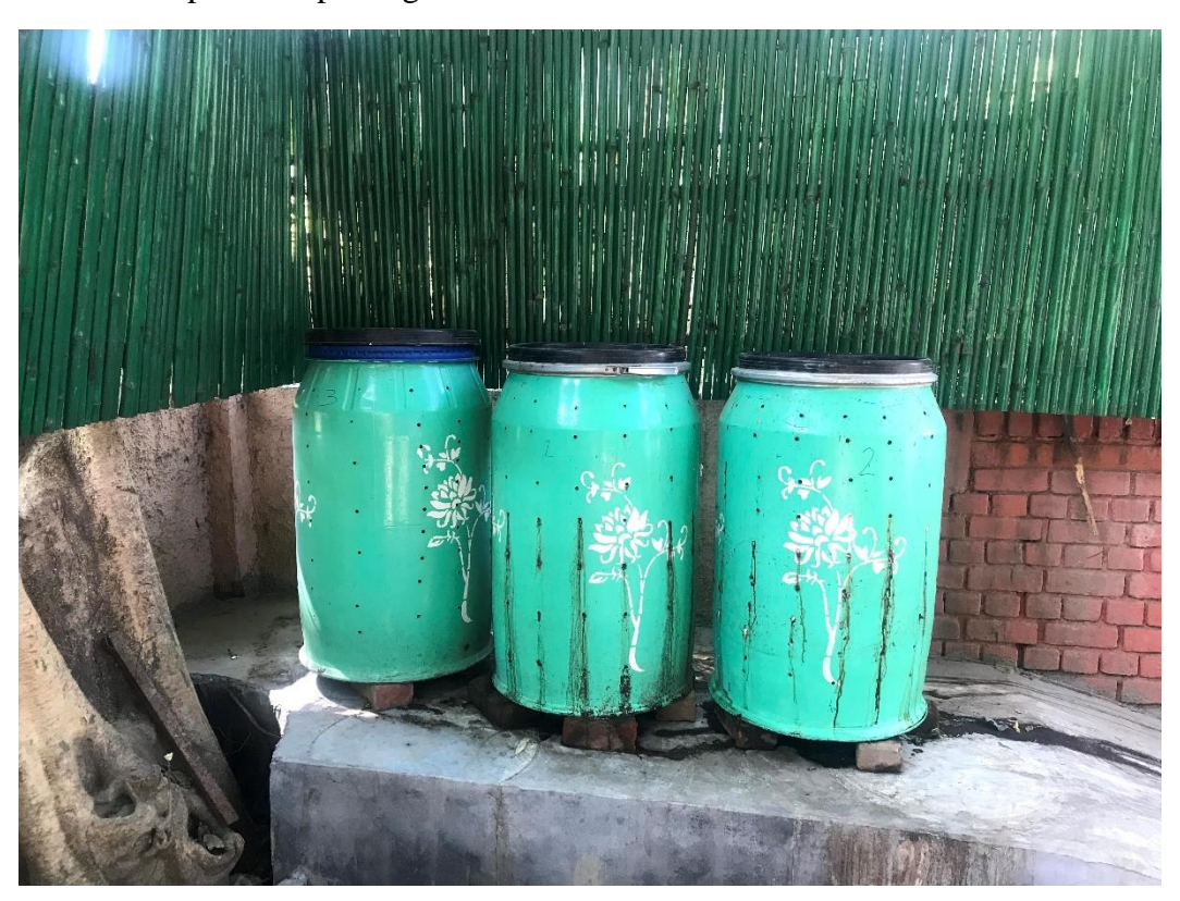
Functional composting unit.