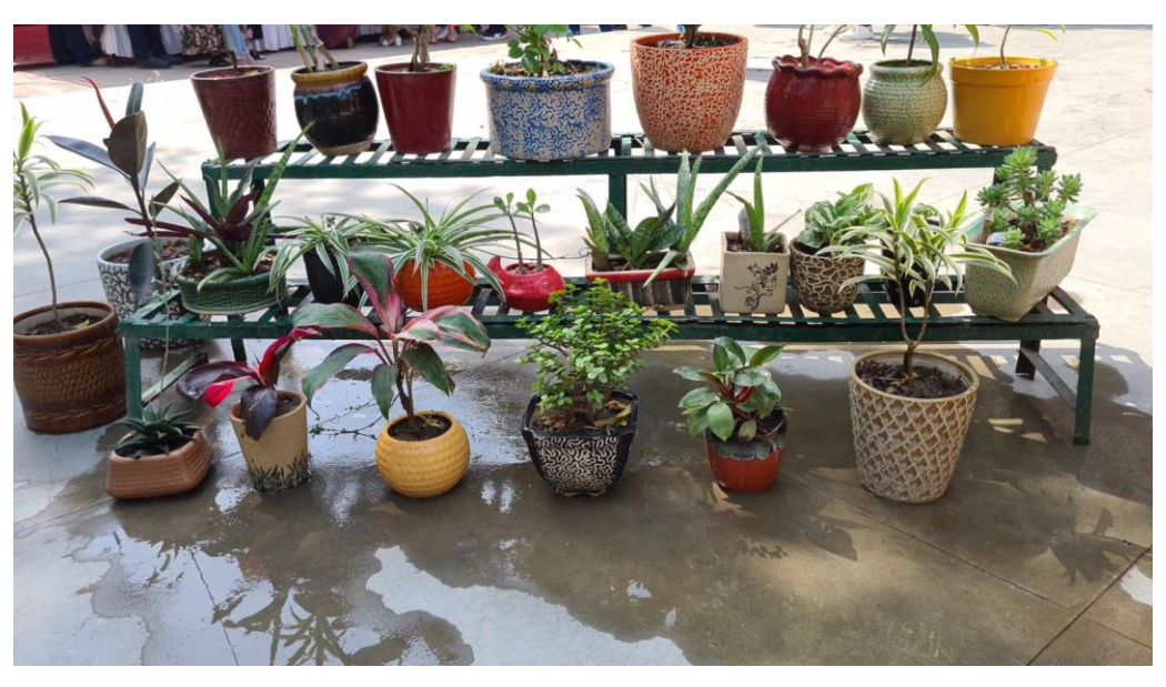
Sale of potted plants in "Basant Bahaar" on 23<sup>rd</sup> March, 2022.